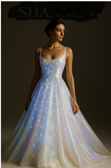
Opaline Eclipse ARCHIVE WORK