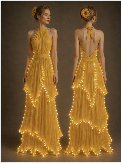
Gold Nocturne ARCHIVE WORK