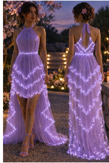
Imperial Orchid ARCHIVE WORK