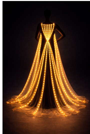
First Celestial ARCHIVE WORK